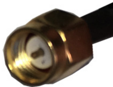
Figure 6 SMA connector with properly located center pin

Except for the ADL140 the single most common defect relates to the Iridium antenna connector. If there was too much tension on the cable the SMA connectors can get damaged. We have also seen tiny dirt particles in the connectors causing signal loss. The most crucial point is the tiny central pin which should not be retracted or similar. Besides that please check the cable for any tight bends or other defects. Sometimes just reattaching the connector solves the problem.