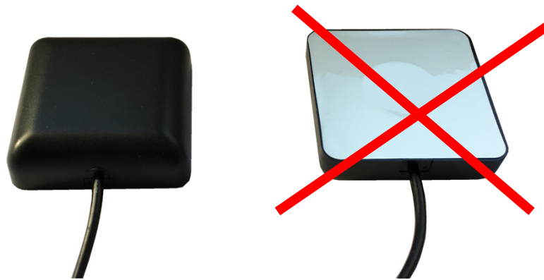
Figure 7 Proper Iridium antenna orientation (left side)