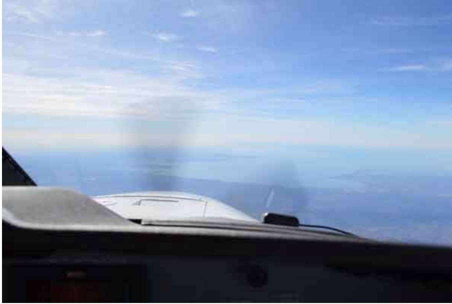
Figure 8 Typical Iridium antenna location in that case slightly right of centerline but still acceptable