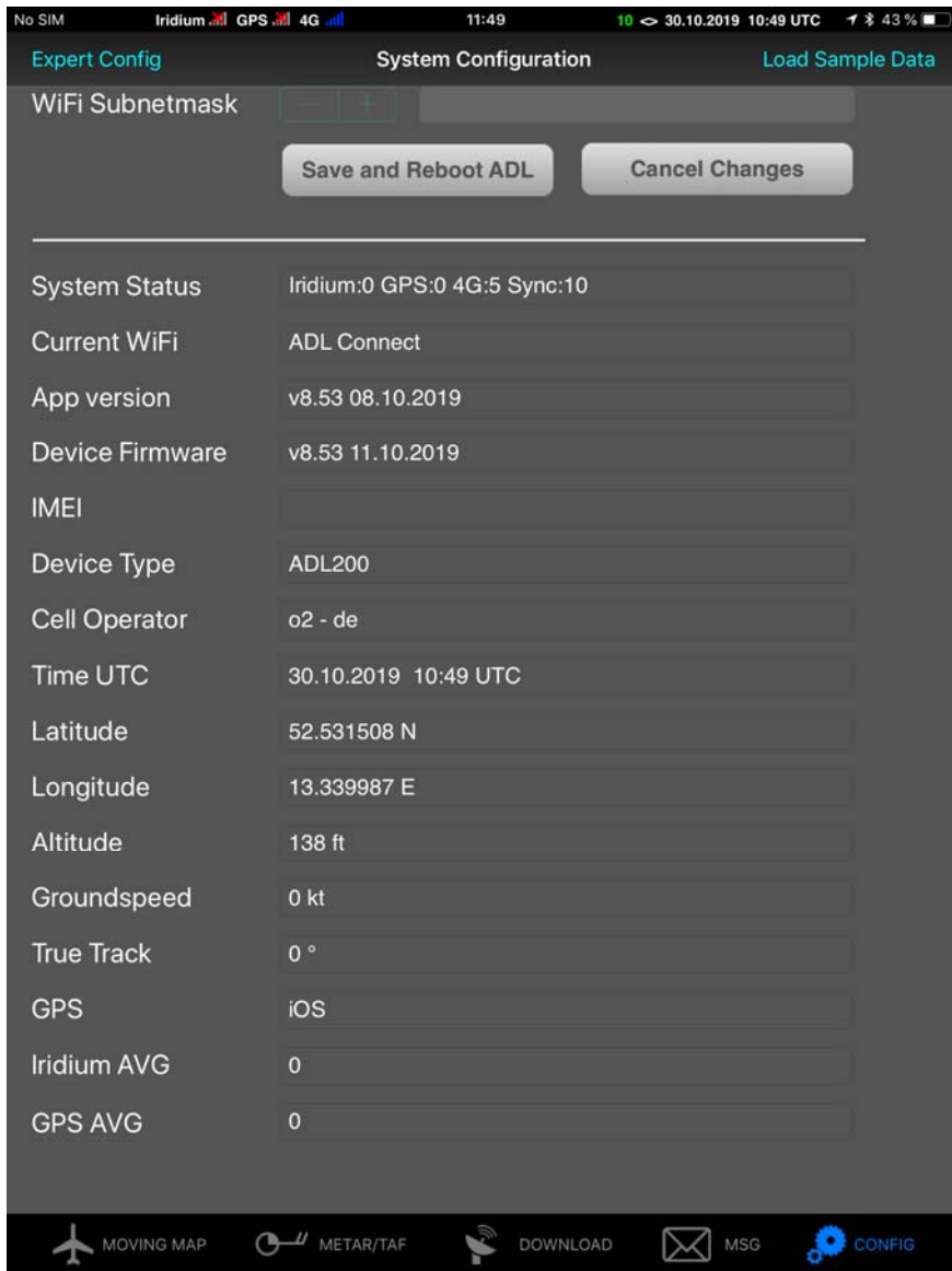
Figure 5 An example of very poor performance which needs investigation